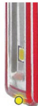
led in punta